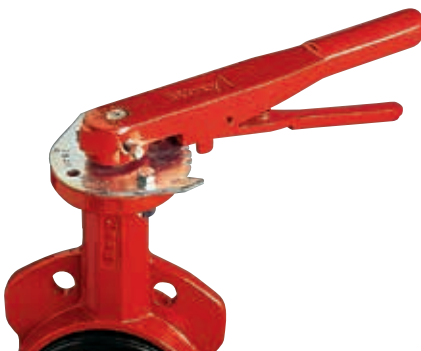
SERIES 1 - Handle & Notch Plate