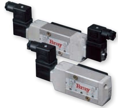
SERIES 63 - 3 & 4 way Solenoids