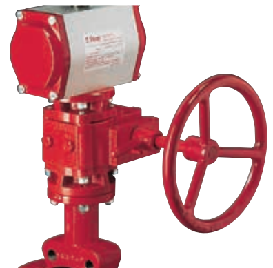
SERIES 5 - Declutchable Gear Operator