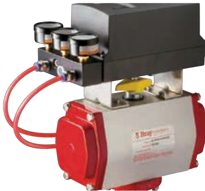
SERIES 6A Electro-Pneumatic Positioners