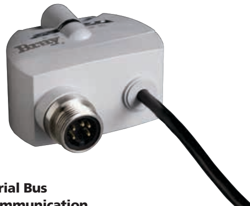
Serial Bus Communication