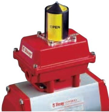
SERIES 50 - Valve Status Monitors