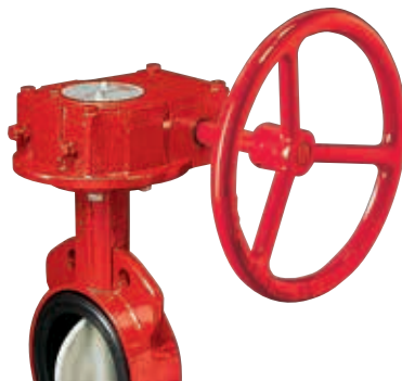
SERIES 4 - Gear Operator