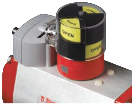
SERIES 52 - Valve Status Monitors